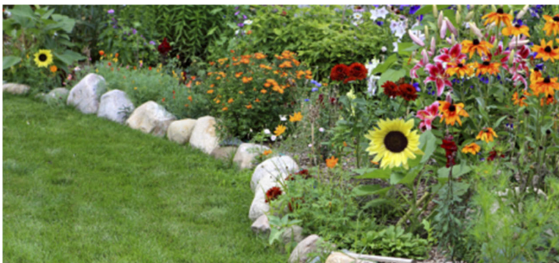
LAWN REPLACEMENT PROGRAM

LTWD partners with Resource Central to bring you the Lawn Replacement Program! Get on the list for next year! Learn more at resourcecentral.org/lawn/ or call 303-999-3820!